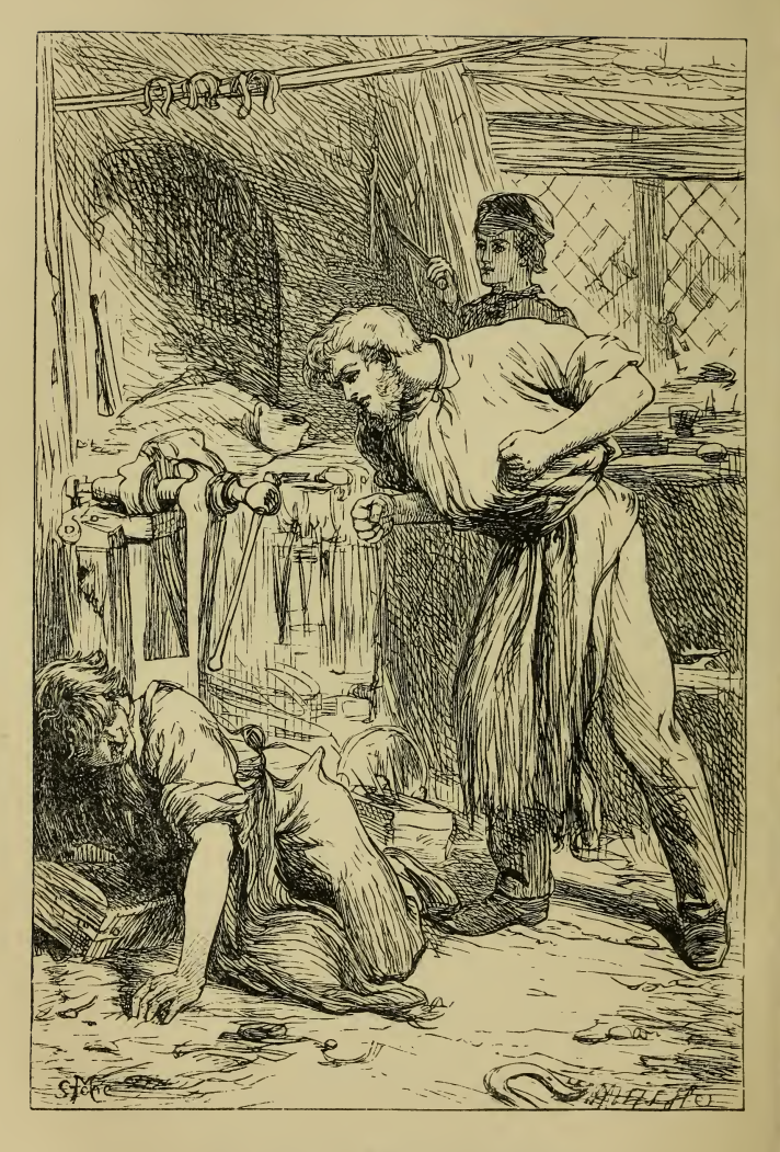
OLD ORLICK AMONG THE CINDERS.